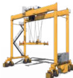
Rubber Tired Gantry Remotely Operated Rubber Tired Gantry