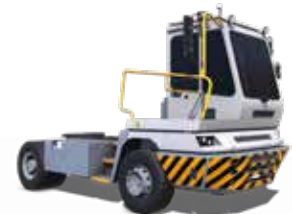
Internal Transfer Vehicle