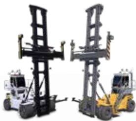
Empty Container Handler Double Empty Container Handler