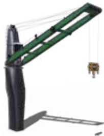
Ship Pedestal Crane