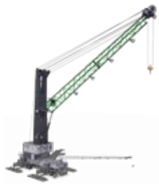
Mobile Harbour Crane