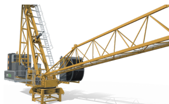
Luffing Tower Crane